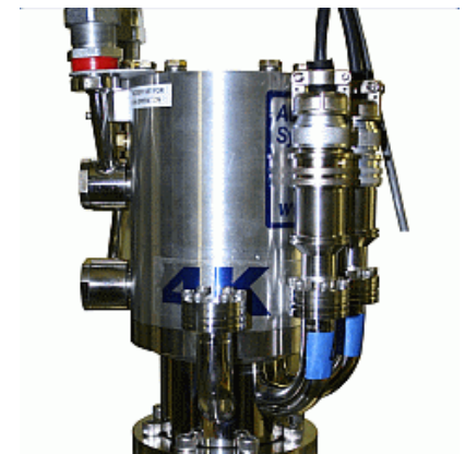
The above picture shows an instrumentation skirt with the electrical feedthroughs rotated 90 degrees upwards to allow for tight rotational clearances.