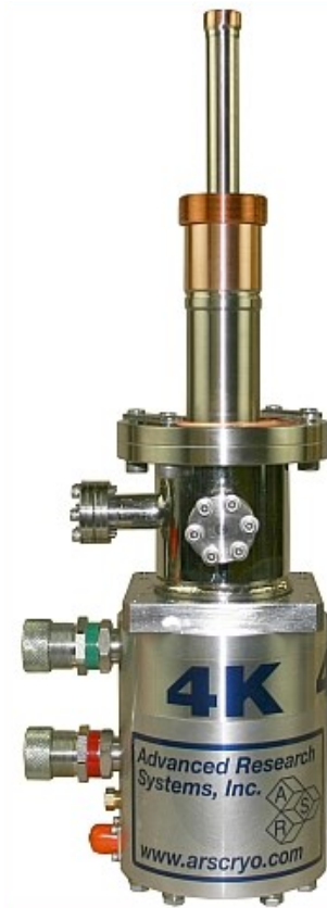
The above picture shows a True UHV Closed Cycle Cryocooler